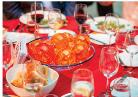
New GlassBall Venue! Montclair Art Museum