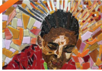
Broadened our Reach (NJPAC|Arts Rx, Great Oaks, Newark Arts Festival)