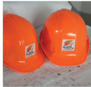
Signed the Lease on our Future Home