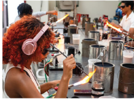
Expanded PRISM Enrollment: Youth and Young Adults