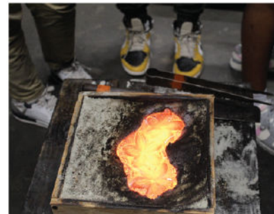
New Technique! Sand Casting Makes its Studio Debut