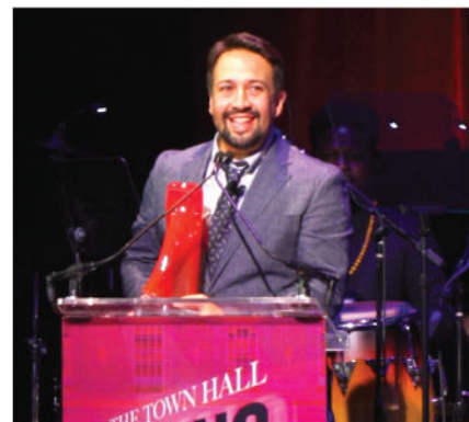
Created 343 Handmade Awards for 73 Partners - The Town Hall Award for Hamilton's Lin-Manuel Miranda